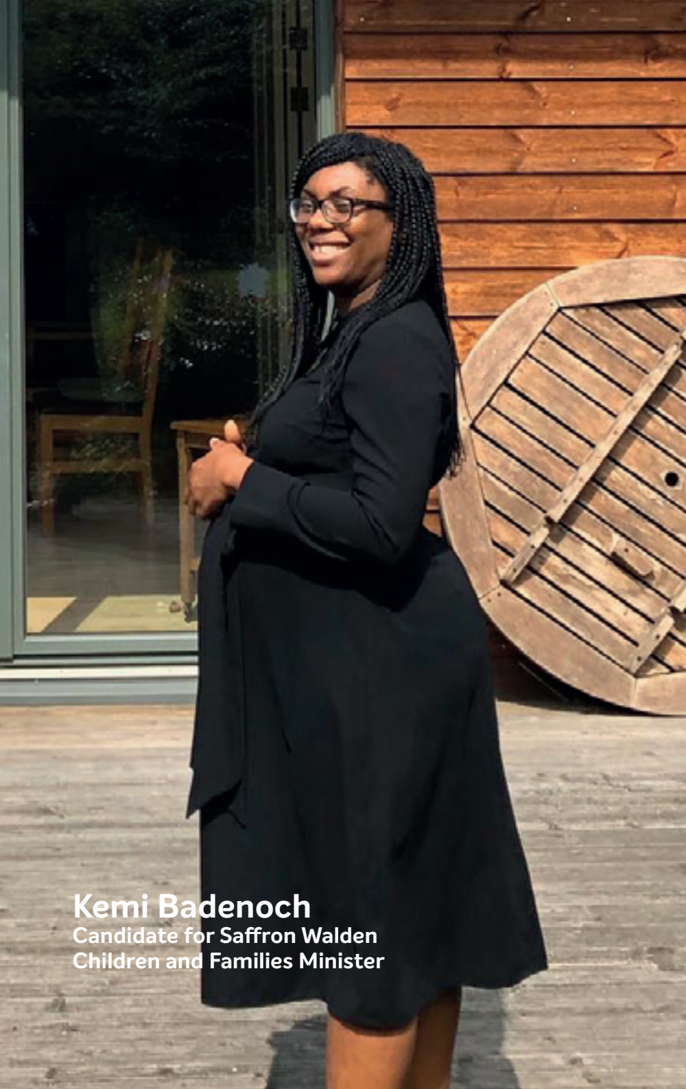
Kemi Badenoch Candidate for Saffron Walden Children and Families Minister

employment and high standards – between dynamic growth and protecting employees from unfair policies and discriminatory treatment. Over the last year, for example, unemployment has continued to fall, even as average real wages have increased.