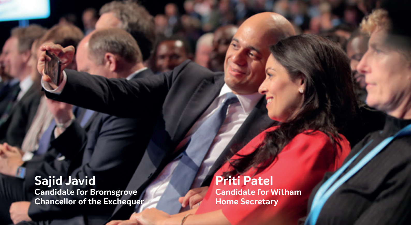
Sajid Javid Candidate for Bromsgrove Chancellor of the Exchequer