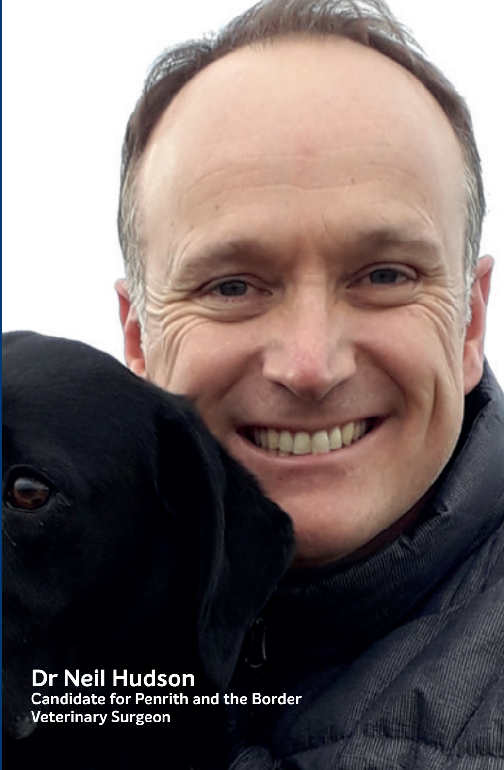
Dr Neil Hudson Candidate for Penrith and the Border Veterinary Surgeon